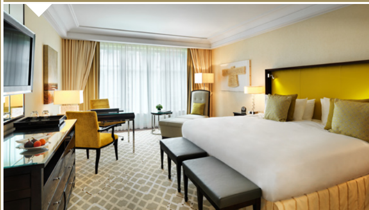
46 SUPERIOR ROOMS (40 sqm)