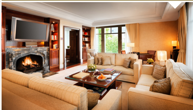
3 GRAND SUITES (120 sqm)