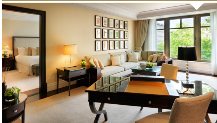
7 CAPELLA SUITES (76 sqm)