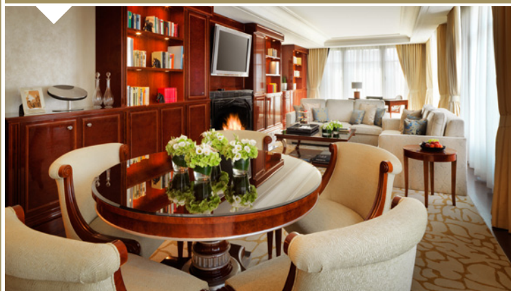
2 PRESIDENTIAL SUITES (172 – 222 sqm)