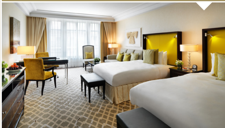
35 DELUXE ROOMS (48 – 55 sqm)