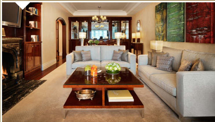
8 EXECUTIVE SUITES (91 – 96 sqm)